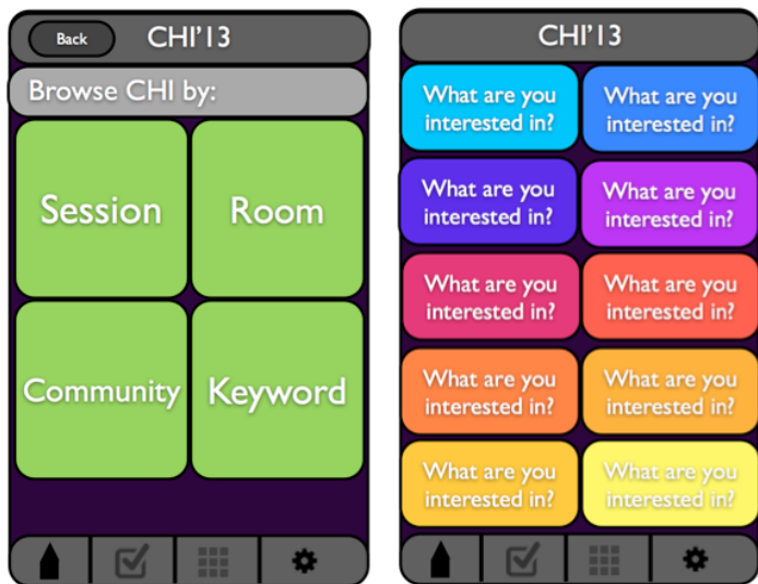
Figure 4: An early prototype of the mobile interface. (a) (left) Choosing to filter the conference by session, room, community or keyword. (b) (right) The main mobile interface which maps to the interactive filtering tiles view.

The CHI'13 mobile application is attendees' primary mechanism for interacting with the large displays. Implemented as an HTML5 web application embedded in the larger CHI'13 mobile application, attendees begin by selecting which large display they would like to connect to. If the chosen screen is setup for interactive filtering, an attendee can select a particular time context (now, next sessions, or the entire conference) and then begin to define a filter (e.g. by community, keyword, or session) – Fig. 4(a). Once a filter has been chosen, the interface POSTs this